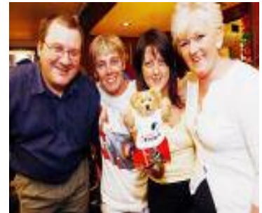
Tartan Arms Staff with their well travelled Bear