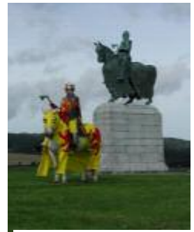
Taken at re-enactment of the Battle of Bannockburn 2002