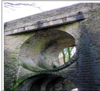
Telford's circular roadbridge over the Bannock Burn

The Scottish Rights of Way and Access Society also known as Scotways keep a catalogue of all known routes; some routes are only known to local people. Scotways only become aware of them when a problem is reported. If you know of a right of way that that may not be recorded or is not in use for