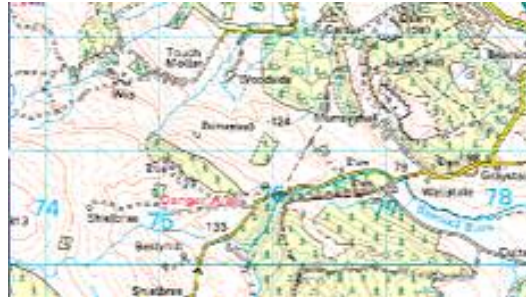
Grid Ref: NS760910 X: 276000m Y: 691000m Lat: 56:05:44N Lon: 3:59:41W

At its height in the 18 th and 19 th century at Craigend and Murrayshall the lime industry would produce one ton of quicklime (calcium oxide) for every two tons of rock burned. Ten to fifteen tons of lime was needed for each two to five acres of field and as most of Stirling was under cultivation as well as the demand for mortar these kilns were in use for most of the year. In spring and summer they would burn day and night. Part payment for lime burners was a quart of beer, thirsty work! Quick lime was a dangerous product, it could cause severe burns and if it entered the eyes blindness would often be the result. Asphyxiation was also a real hazard for the lime burners. In winter vagrants would seek the warmth of the kilns, but some fell victim to the fumes and others actually fell into the kiln itself. Adding water produces slaked lime (calcium hydroxide). The further addition of sand forms a superior mortar for building purposes. It was common practise for farmers